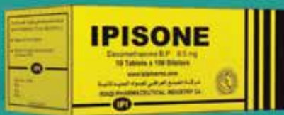
Ipihone 0.5 mg