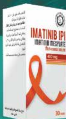
Imatinib IPI 400mg, 100mg