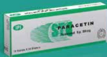
Paracetin 500 mg