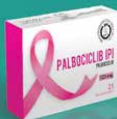
Palbociclib IPI 125 mg, 100 mg