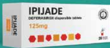
Ipijade 500 mg / 125 m