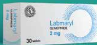
Labmaryl 1, 2, 3, 3, 4 mg