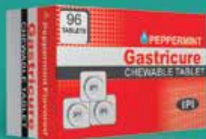
Gastricure Chewable Tablet