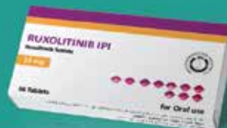
Ruxolitinib IPI 15 mg, 5 mg

Products may not be available in all territories due to patent restrictions.