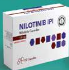
Nilotinib IPI 200 mg , 150 mg