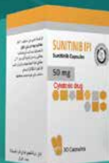
Sunitinib IPI 50 mg, 25 mg, 12.5mg