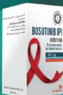
Bosutinib IPI 400mg