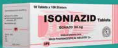
Isoniazid 100 mg