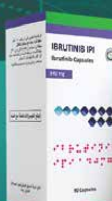
Ibrutinib IPI 140 mg