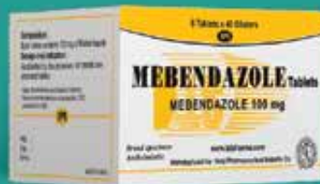
Mebendazole Tablets 100 mg

Products may not be available in all territories due to patent restrictions.