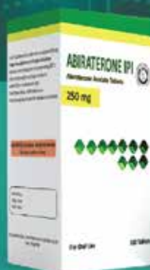
Abiraterone IPI 250 mg